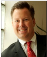
Mayor Kevin Hutchinson

It is very important to us at the City of Columbia to provide communication options for emergency notifications as well as general City information. The Columbia police & public works departments and city staff are fine-tuning our options to send this information via phone call, text message and/or e-mail. I encourage each citizen of Columbia to visit our website (see directions below) and sign up for the items that are important to you. Categories have been added, so if you have already signed up, please review/update your account.