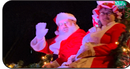
Bright Night Christmas Parade