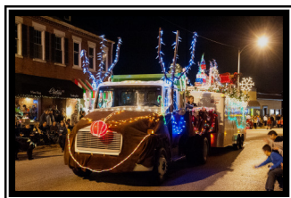
1st Place—2012 Beds & Boarders

December 7, 5 pm: Join us for a bright night of Christmas lights down Main St. Parade starts at Rueck Road and ends at Cherry St. Bundle up and enjoy this special event full of Christmas spirit. The festivities continue after the parade at Turner Hall's Christmas Social.