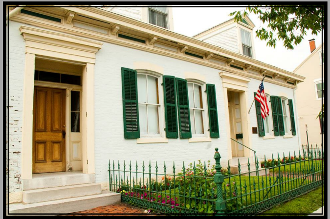
Miller-Fiege House 2015