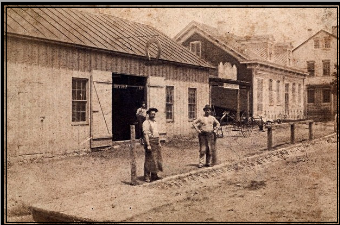
Miller-Fiege Home (right) Circa 1890

Stay tuned for upcoming dates where the home will be open for community enjoyment! Scheduled tours for groups are always welcome. Call us today to make an appointment! Like us on Facebook to stay up-to-date with the happenings of the home; just search 'Miller-Fiege Home'